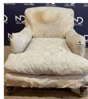
Armchair by Howard & Sons original ticking, cabriole legs castors & Maker's mark – Sold for £4,400