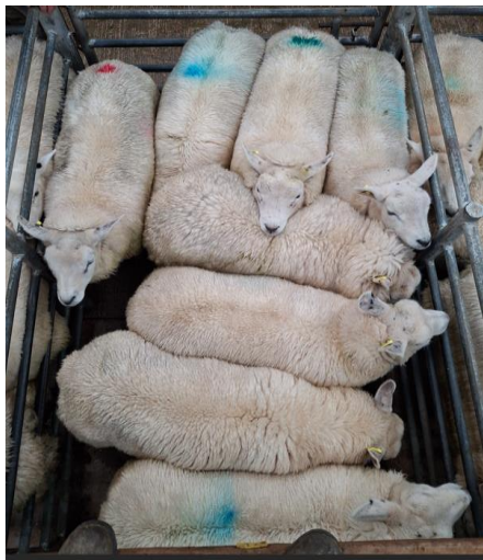
Top Price Store Lambs from Store Sale 17 th January 2025