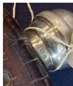
Silver crocodile leather hip flask and beaker – Sold for £220